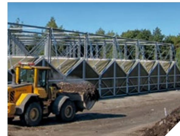
BIODEGMA® - Membrane technology