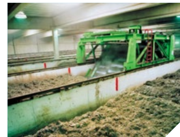
BioFIX - Line composting system