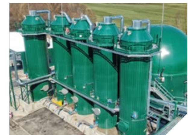
BioPV - Organic waste press water digestion