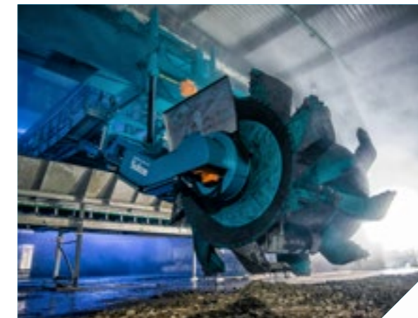
Wendelin - Windrow composting system