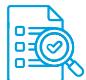
HANDOVER & TRAINING