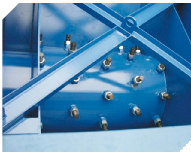
Roll with adjustable and stable opening teeth.